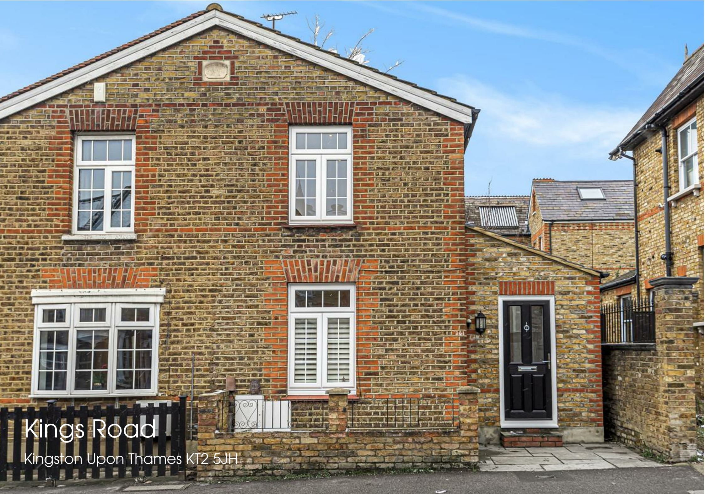
Kings Road Kingston Upon Thames KT2 5JH